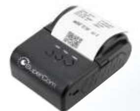
Bluetooth receipts printer