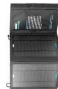
Recharger solar panel